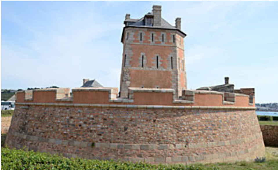
Fort Vauban at Camerat

The town is quite small but we enjoyed the underground showers beside the Capitanaire and a walk on the seafront. The next morning we knew we were leaving Brittany as it rained intermittently.