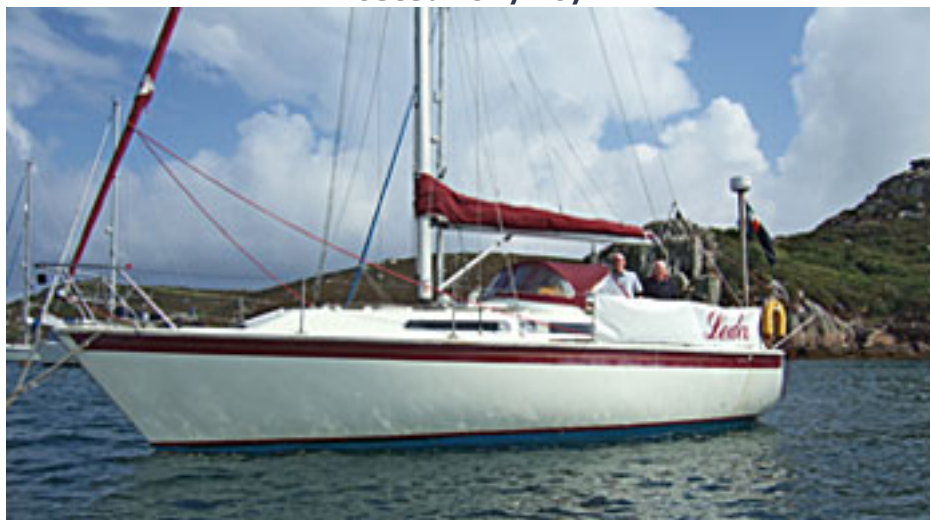
Leda on moorings in New Grimsby, Tresco in background