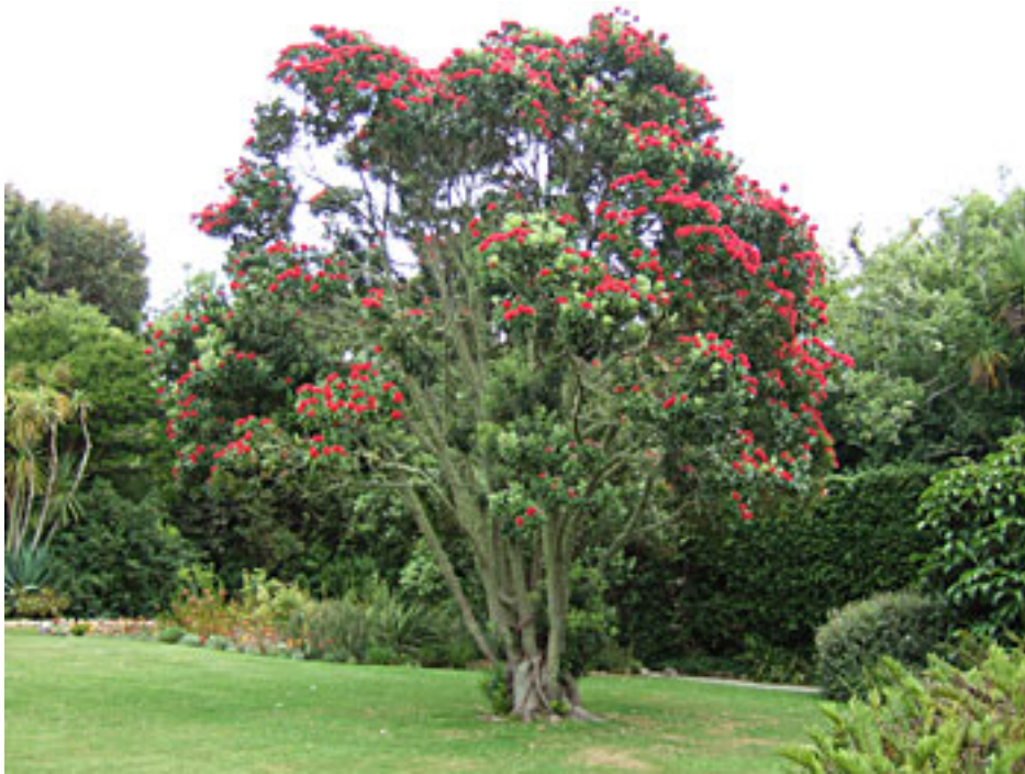
Abbey Garden, Tresco, Chilean "Bottlebrush" tree

One whole afternoon was spend visiting the Tresco Abbey Gardens - more info at www.tresco.co.uk - which describes it thus: