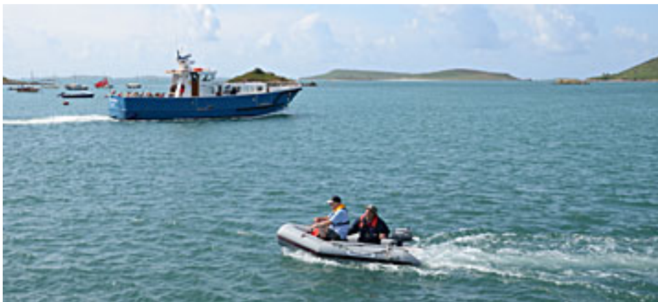
Seamus and Peter in transit

We had 3 great days in Tresco, motoring in the rubber duck in and out to the harbour, dodging the ferries to the other islands.