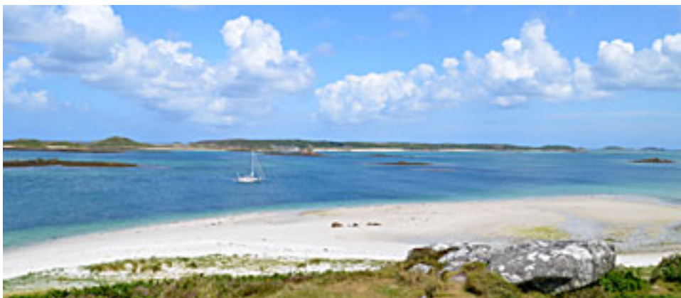
Beach on East side of Tresco

The island of Tresco has many beautiful beaches and the flat terrain is ideal for gentle walking.