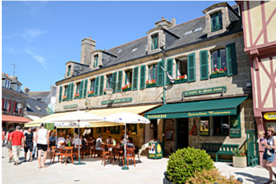
Concarneau - town square

The following morning we cast off at 0830 and had a bumpy passage through the Raz de Sein an hour after low water in light airs, followed by Robert Michael in Mystique.