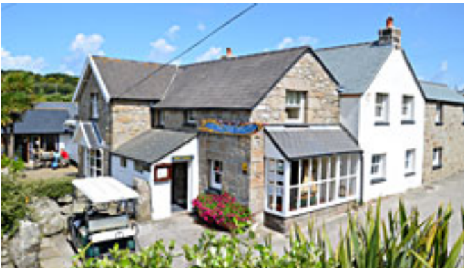
The New Inn

The New Inn was our main base, enjoying local ales and good food. It is a busy spot but the service was good and the outdoor area popular in the sun. The sparrows eat out of your hand.