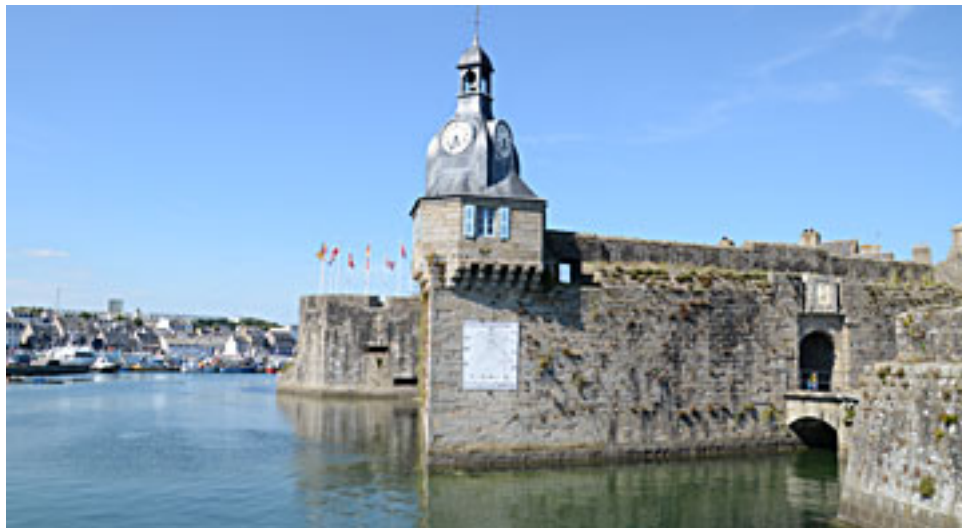
Entrance to Concarneau old town:

That evening the crew walked around the perimeter of the town walls. In such weather the major decision is which pair of shorts to wear.