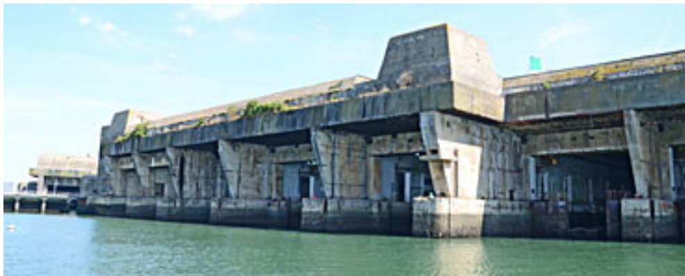
WW2 submarine pens