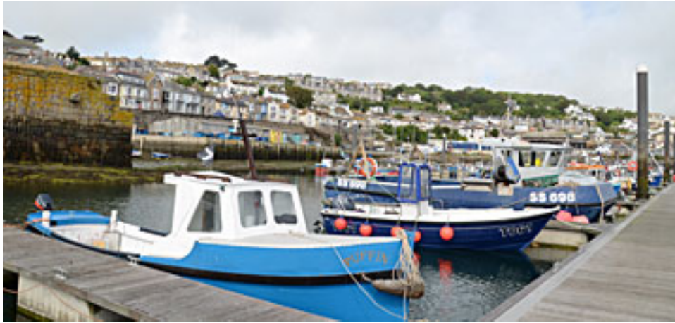
Newlyn town from the marina. A functional fishing port

Having used up a lot of diesel we tried to get fuel but found under the new regulations we could not buy marked diesel, so had to borrow cans and take a taxi to the nearest filling station a couple of miles away.