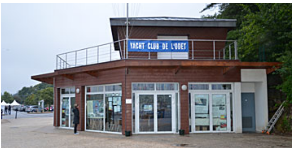
Benodet: Yacht Club de L'Odét

As we tied up in Benodet at 1430, it started raining again. Every place seemed to be closed so wandered about under brollies, eventually ending up in a pizza restaurant, the only place we could find open. It bucketed rain all night.