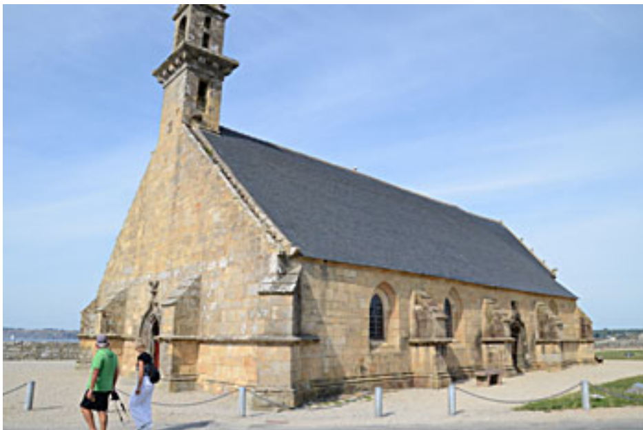
The old church at the harbour, where a concert was being staged

The town is quite small but we enjoyed the underground showers beside the Capitanaire and a walk on the seafront. The next morning we knew we were leaving Brittany as it rained intermittently.