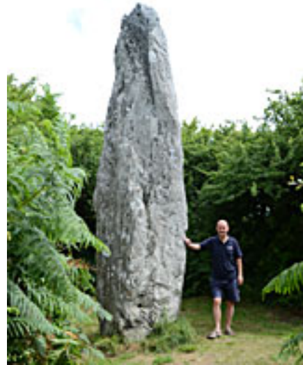
Menhir de Kermario

Thursday 23rd June: 1200 departed Ile de Groix for Belle Ile. We passed the three masted barque 'Belem' which was on route to the Tall Ships Festival in Waterford.