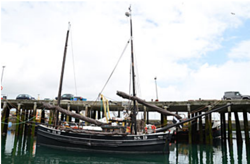
SS19 "Ripple" the 110 yr old 44' 15 ton double-ended sailing fishing lugger in Newlyn, recently restored See website

We left Newlyn at midday for Camaret in Brittany, into a south-westerly force 3-4. with complete cloud cover most of the way.