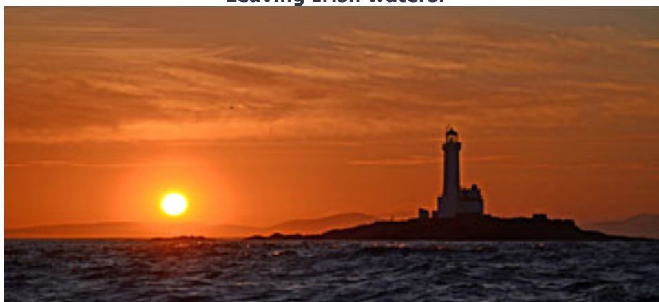
Tuskar Rock lighthouse and Wexford coast at sunset

The following morning revealed a beautiful dawn but by mid afternoon we were into a cold thrash against a force 4/5 southerly. With our speed down to 4kts we decided the Scillies was not a realistic option and bore off for Lands End, eventually getting into Newlyn cold and tired at 0100 Wednesday.