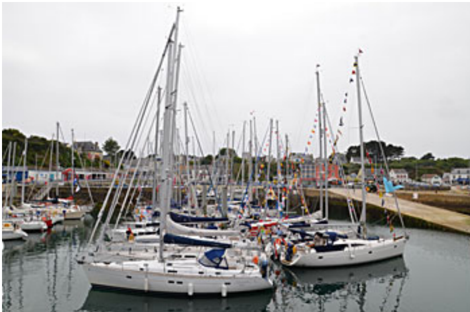
Ile de Groix - ICC Rally boats