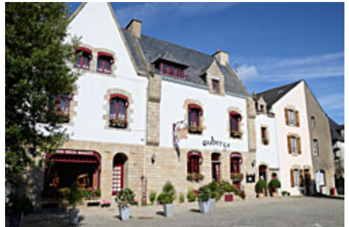
Part of the old town

The summer holiday mood at last kicked in and several days were spent walking, relaxing in the sun and sneaking into bars with a/c for chilled beers.