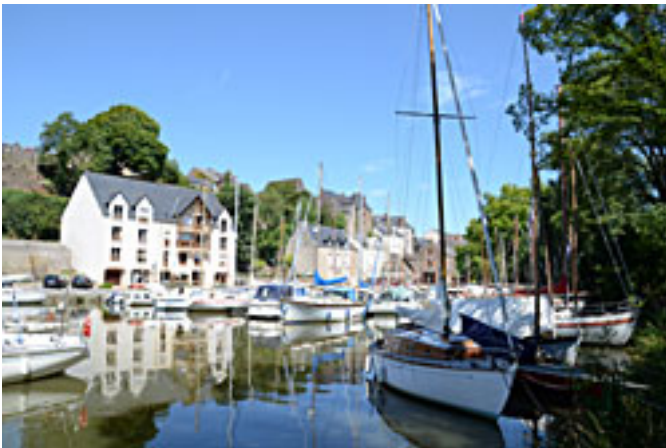
La Roche Bernard old port