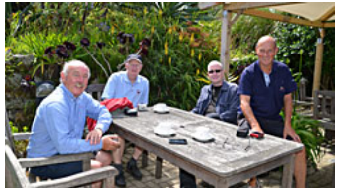
Leda crew soak up the sun Click for larger size photo >>

For more formal fare a visit to The Island Hotel is worthwhile, with nice walks in the area and good food again. It has time-share apartments for sale / to rent.