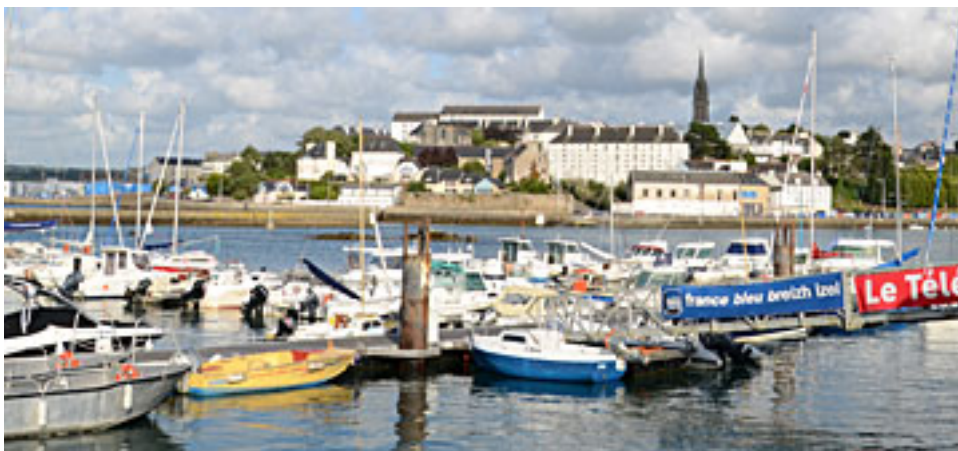
Douarnenez - pontoons

Douarnenez is a busy yachting centre with a huge range of boats and sailing facilities, schools etc. Their maritime festival in 2004, a record year, comprised almost 2000 sailing vessels, 17,000 sailors and 30 participating countries, with the emphasis on traditional craft. The mini-Fastnet was lined up to go the next day.