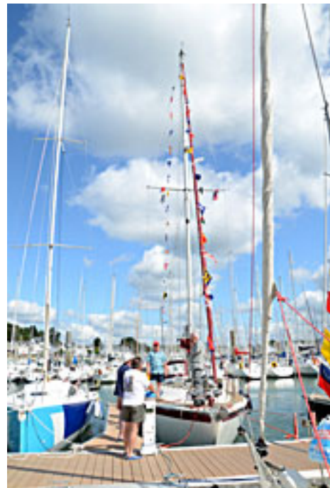
Leda dressing at La Trinite