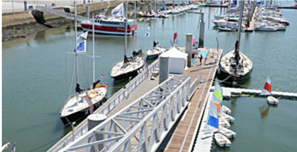
The Pen Duick boats all together

After 2 days Leda headed on to Concarneau on 3rd July, motoring in sun through flat seas again.