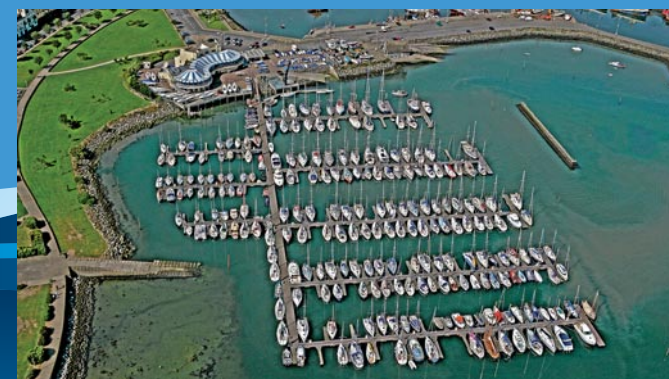
Howth Yacht Club marina.